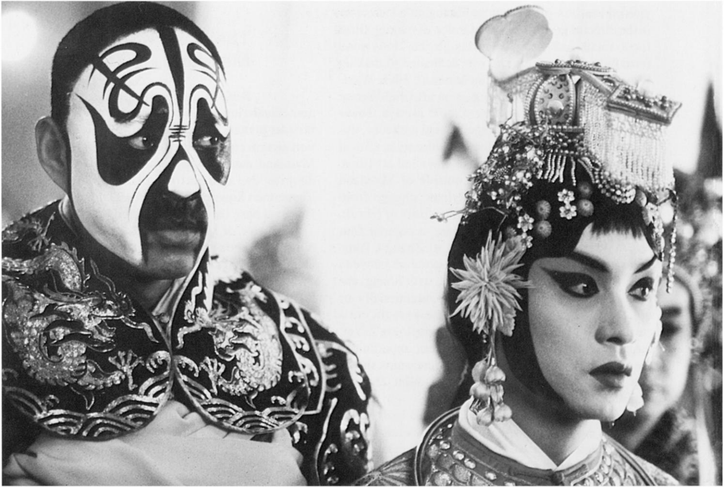
The two male leads of Concubine dressed for their Beijing Opera performance

In addition to the vast geographical and historical resources that China has to offer, co-production is important for the Hong Kong film industry for other reasons. First, co-production with the Mainland almost guarantees distribution and exhibition in the huge market of China. Second, because of the upcoming transition of 1997, a significant number of media talents have migrated overseas, resulting in a continuous weakening in the supply of personnel. Mainland China, with her state-supported film training program, can provide the extra hands that Hong Kong needs.