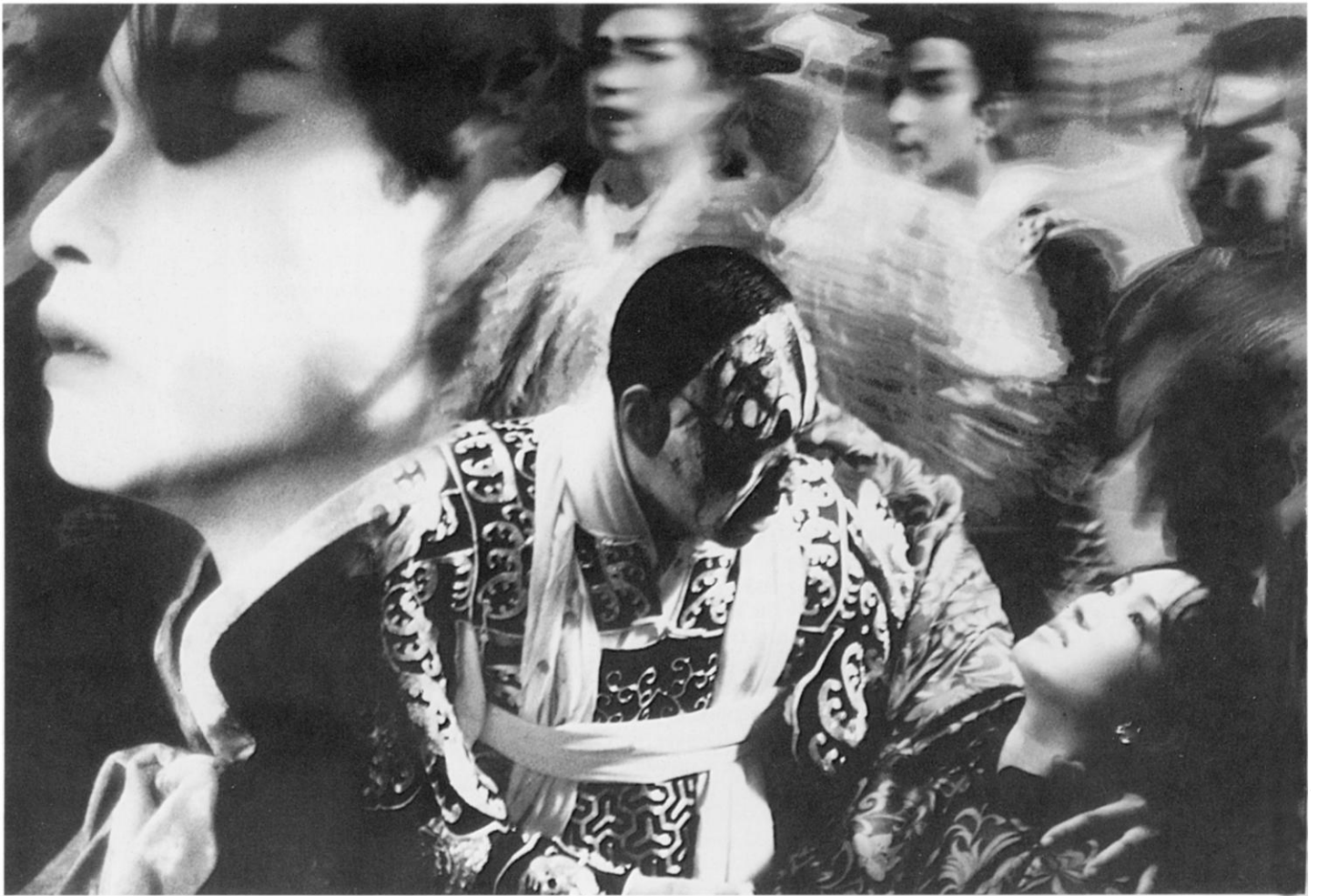
Leslie Cheung, Zhang Fengyi, and Gong-li in Farewell My Concubine (above); director Chen Kaige (opposite)

Chinese directors Chen Kaige and Zhang Yimou are “in.” Europeans have honored them with prestigious prizes while in the United States critics and scholars have responded with voluminous commentary, over a hundred articles in the past two years alone. Most critics acknowledge these two talented directors as superbly refined representatives of Chinese cinema. Chen’s latest piece, Farewell My Concubine , was crowned with the Palme d’Or in the 1993 Cannes Film Festival. The film was also a hot candidate for the Best Foreign Language Film Award in the 1993 Oscar ceremony but surprisingly failed to win the prize. 1 Similar to events around other recent films such as Judou and Raise the Red Lantern , the Mainland government’s repeated banning and later screening of Concubine stirred further attention to and celebration of the film.