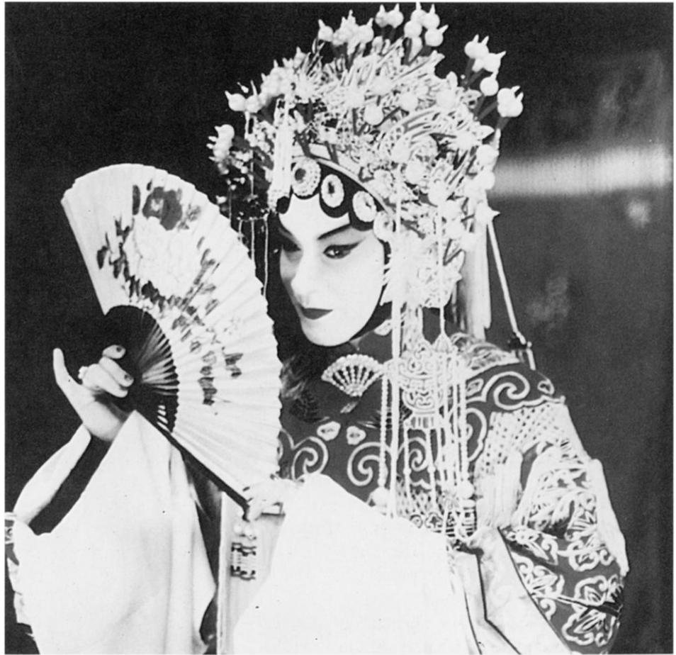
Leslie Cheung: the male performer as female spectacle

of imminence. Unfortunately, the weakness of her scripts lies exactly in her characters' superficial relation to history.